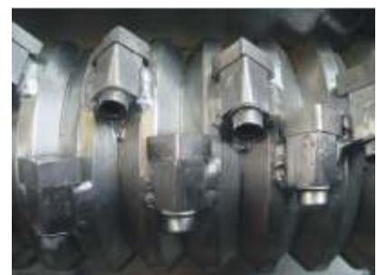
Profile rotor with welded knife carriers