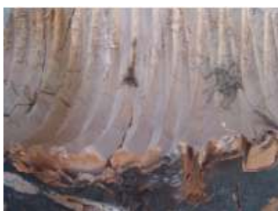
A clean cut even with solid wood