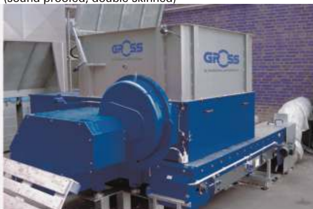
GAZ 122 on mount with extraction