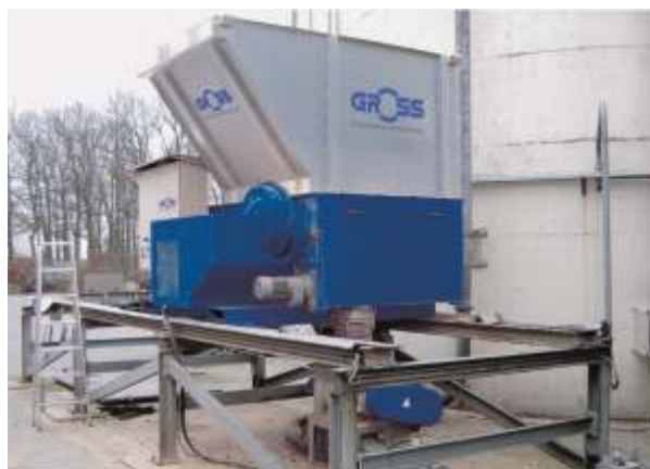
GAZ 122 on mount with extraction