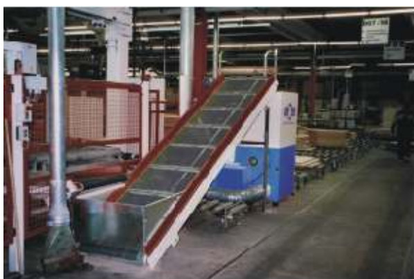
GAZ 82 deployed in furniture manufacture