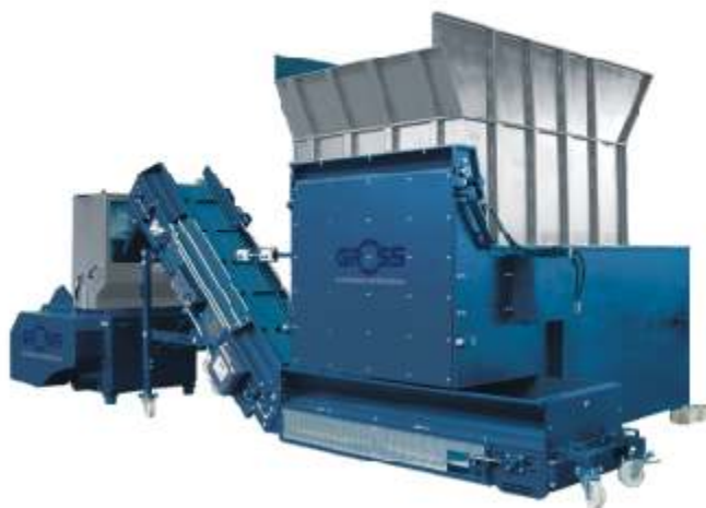
Two-step shredding single-shaft shredder GAZ 252 Herkules I, combined with GNZ mill