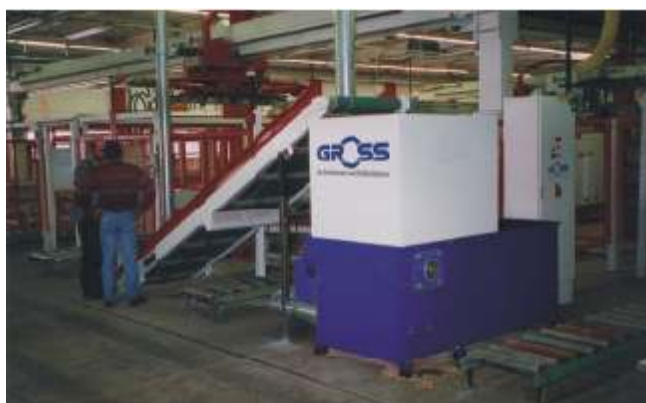
GAZ 82 with customer specific hopper (sound proofed, double skinned)