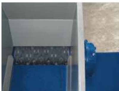
Hopper and Rotor with 362 mm diameter for a high throughput capacity