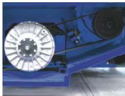
Transmission and hydro coupling