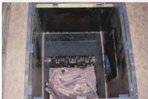
GAZ 102 in pit