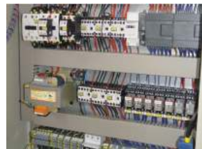
Switching cabinet / SPS control