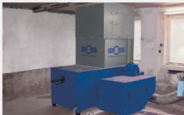
GAZ 102 set up below ground, with hopper expansion