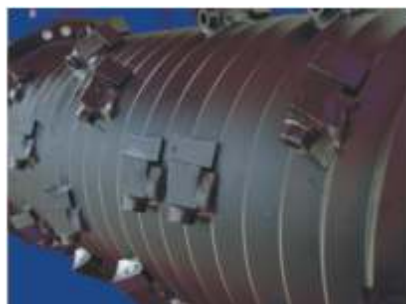
Profile rotor with a diameter of 368 mm and concave knives